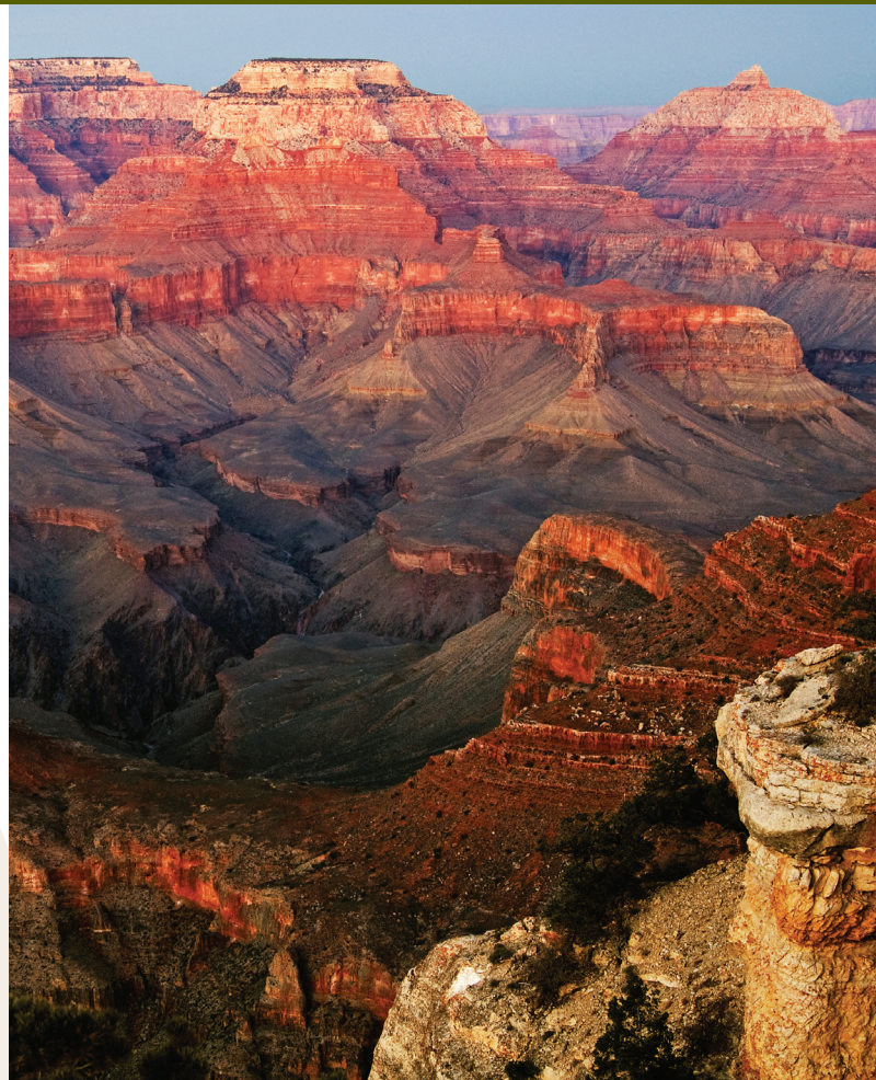
The Grand Canyon represents one of the most awe-inspiring landscapes in the United States. At the deepest parts of the canyon, nearly two-billion-year-old metamorphic rock is exposed. The Colorado River has cut through layers of colorful sedimentary rock as the Colorado Plateau has uplifted.

2.5 Studying other objects in the solar system helps us learn Earth's history. Active geologic processes such as plate tectonics and erosion have destroyed or altered most of Earth's early rock record. Many aspects of Earth's early history are revealed by objects in the solar system that have not changed as much as Earth has.